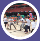
MULTI SKILL GAMES